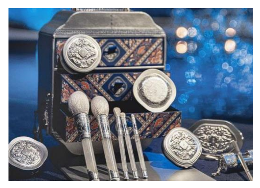
Fig.2 Miao silver (high-end series) gift box of Huaxizi

One of the distinctive elements of the Huaxizi is the use of Chinese elements. For example, in the design and creation of Miao impression (high-end series) makeup, Huaxi integrated Miao embroidery, Miao silver and other elements. In Miao culture, Miao embroidery and Miao silver is not only a symbol of wealth, representing a love and exquisite national art, but also a rare cultural heritage in our country.