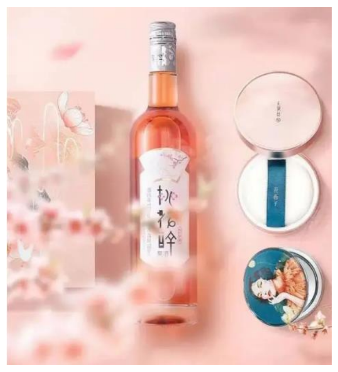
Fig.3 Co-branding gift box of Huaxizi and Luzhou Laojiao (wine)